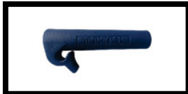
4. Handle Grips MAK-UP-10-V2