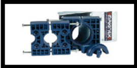
7. Universal Block Set JHTB-U-2