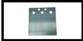
6. Tile Smasher Blade TSH-B