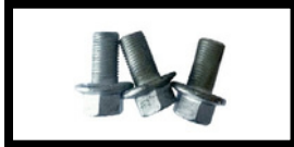
9. Tile Smasher Attachment Bolts TSH-B5-V2-KIT