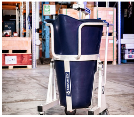
2. Mixing Station MS150