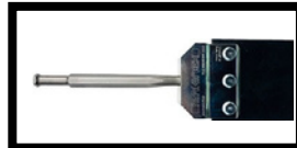
3. Tile Smasher Head with HiTi! HEX Shank Combo V2 TSHC-HS-US-V2