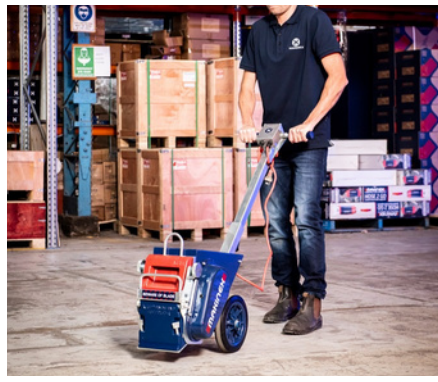
3. Floor Stripper