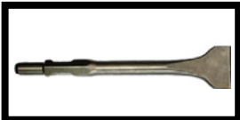
2. Flippable Wide Chisel WCAU-404