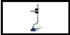
10. Vacuum Attachment JHT-VA-01-00