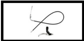
5. Brake lever and Cable JHT-99-63-V2