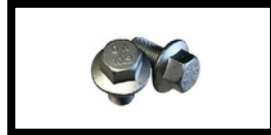
8. Tile Smasher Head Bolts TSH-B5-V2