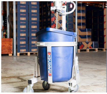
1. Mixing Station MS100